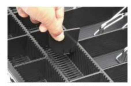
Adjustable Bill & Coin Dividers