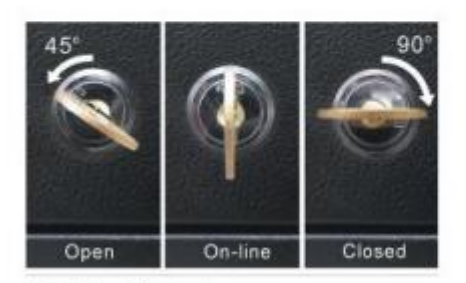
3-Position Key Lock Open, On-line, Closed