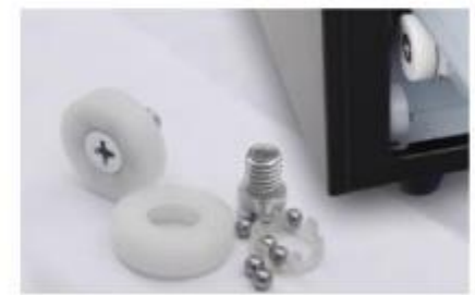
Ball Bearing Rollers Heavy Duty Ball Bearing Rollers, Enhance Durability & Lower Noise.