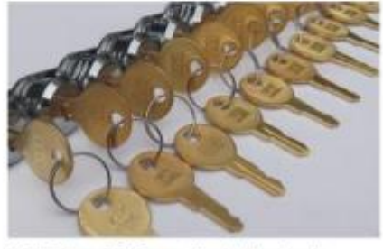
1-100 Sets Different Code Key Lock