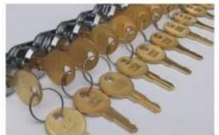
1-100 Sets Different Code Key Lock