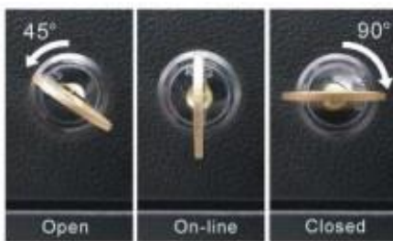
3-Position Key Lock Open, On-line, Closed