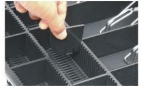
Adjustable Bill & Coin Dividers