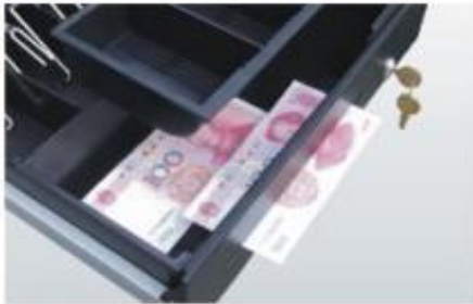
One Media Slot